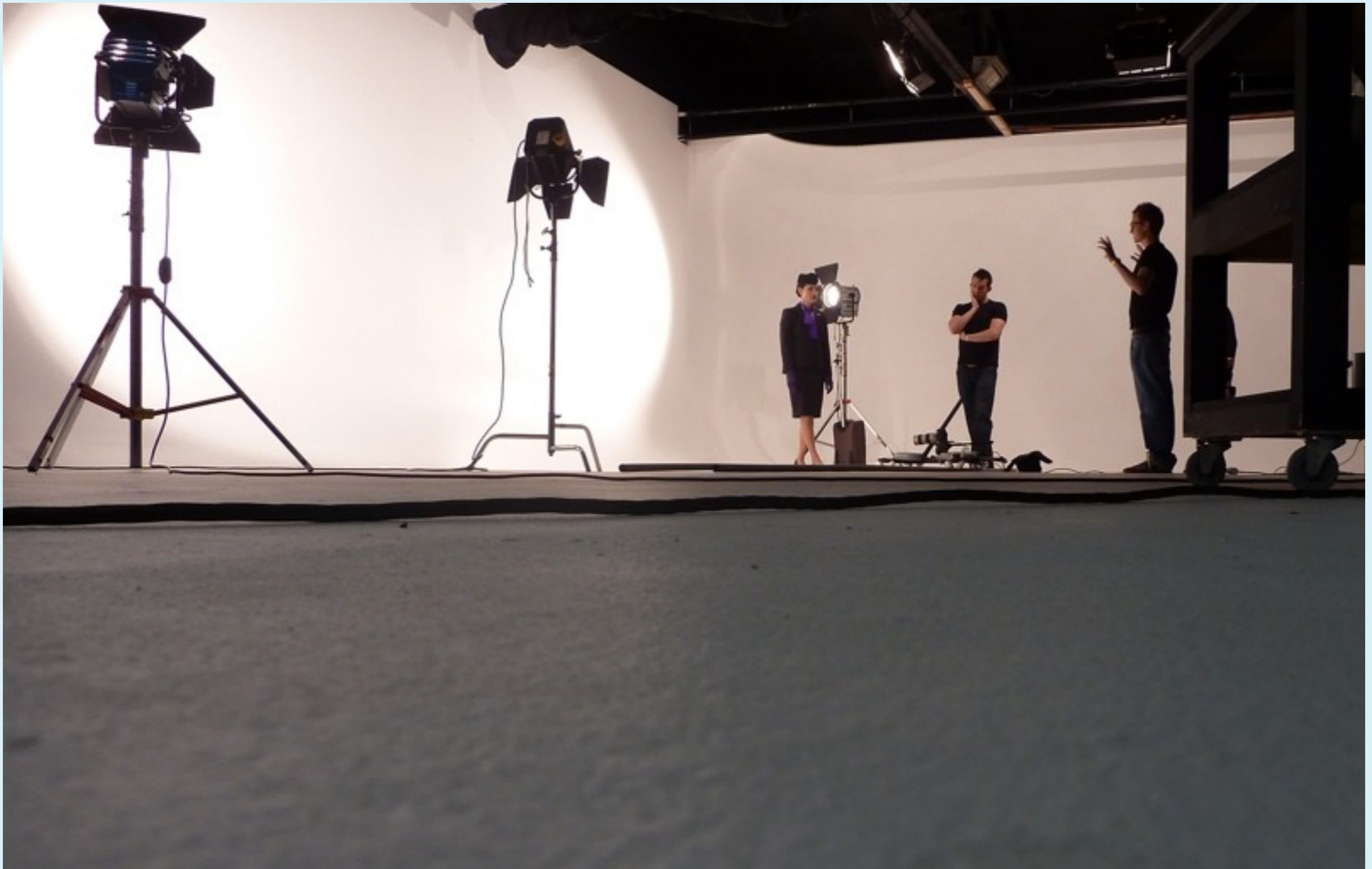
Case Study: BUAV – Cargo Cruelty